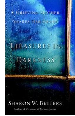
Treasures in Darkness